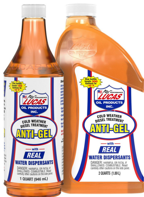
Product #10865 (1 quart), #10866 (2 quarts)

CORONA , Calif. (December 1, 2020) - Lucas Oil Anti-Gel Cold Weather Diesel Treatment (Anti-Gel) is specifically manufactured to prevent cold filter plugging in diesel and biodiesel fuels. Designed by Lucas Oil Products Inc. , the American-based manufacturer and distributor of high-performance automotive additive and lubricant products, Anti-Gel is formulated with the highest quality components to provide maximum performance during the winter season.